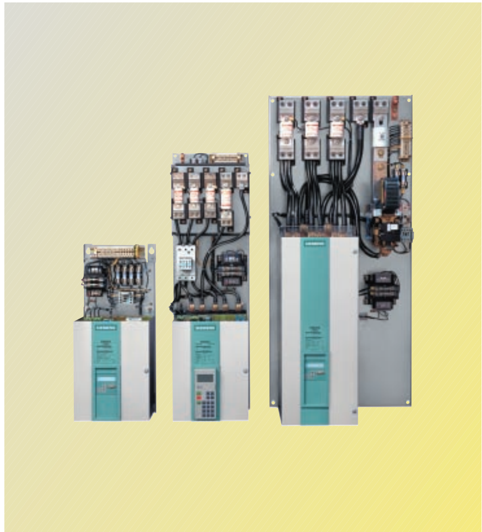
Fig. 3/2 Base drive panel examples of 15 A, 210 A and 510 A models

Drive packages consisting of a base drive controller and motor along with drive enclosures are also available. Consult factory for details and pricing.