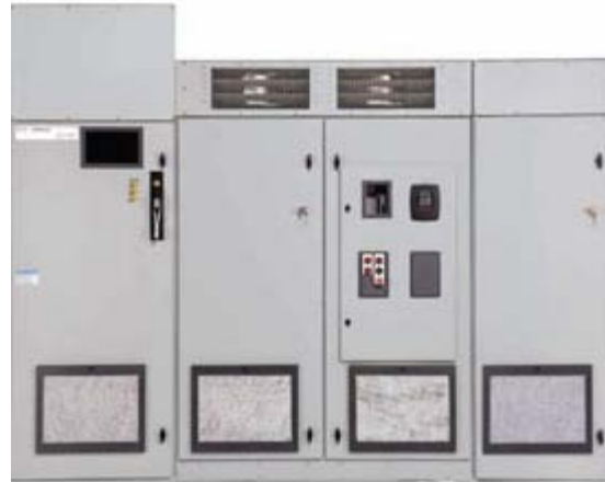
AMPGARD SC 9000 2500HP, 4160V AFD

This version of Products & Services emphasizes our industrial and commercial electrical distribution products and services.